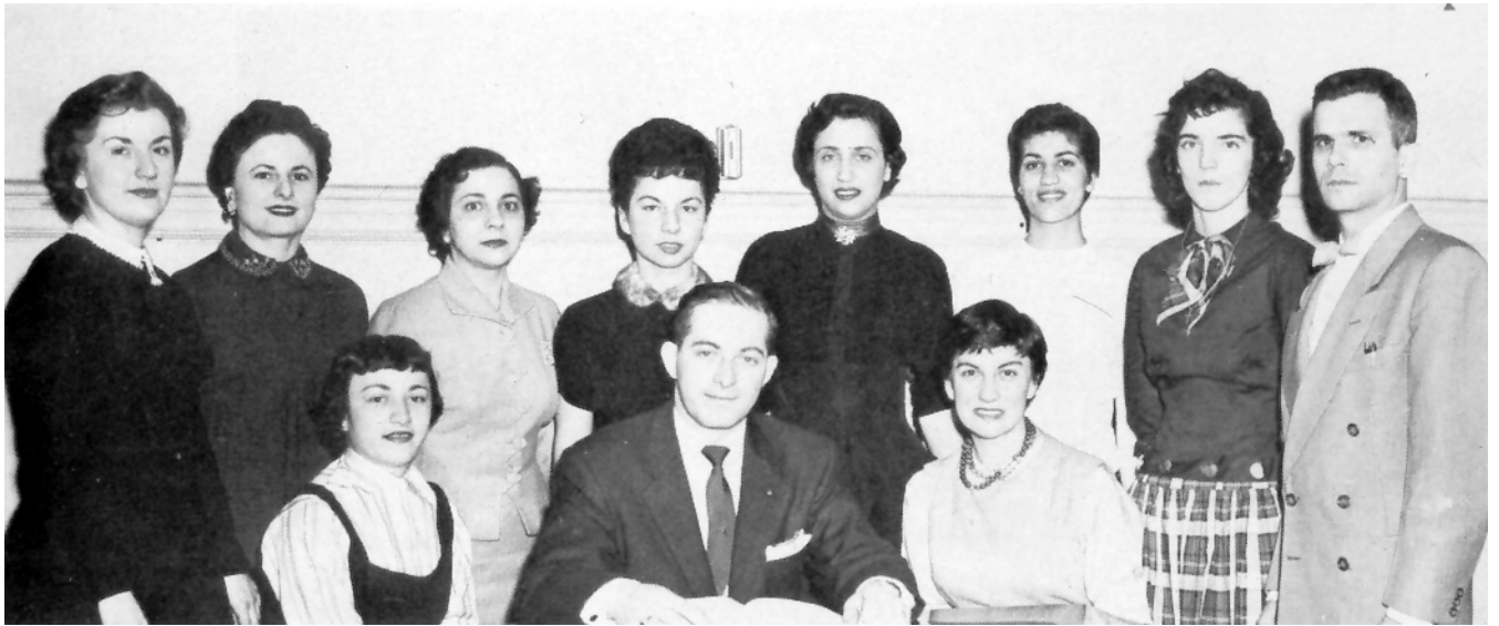
SUNDAY SCHOOL FACULTY 1956