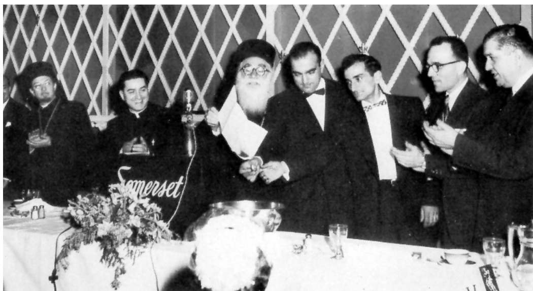
At the time of completion of the church building the Community owed $75,000. Six years later, on February 26, 1956, the mortgage was burned.