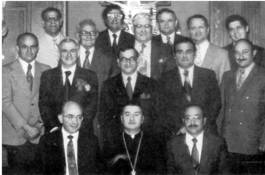
1973 BOARD OF TRUSTEES