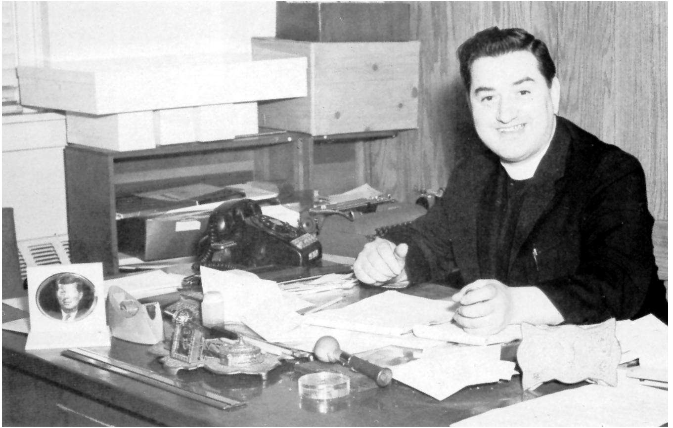
Our hard working spiritual leader who has been with us since 1953.